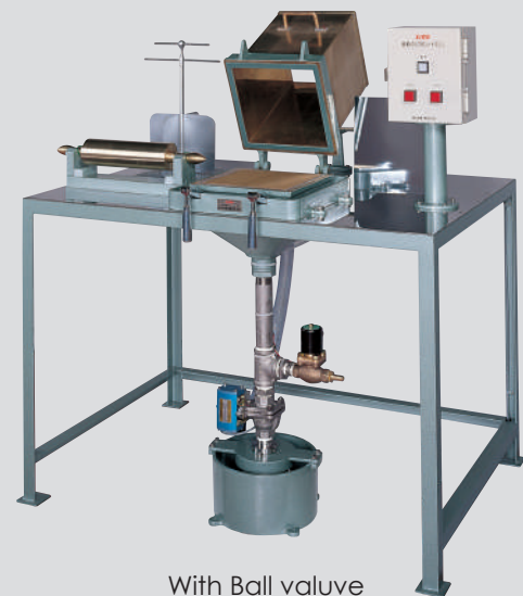
With Ball valve